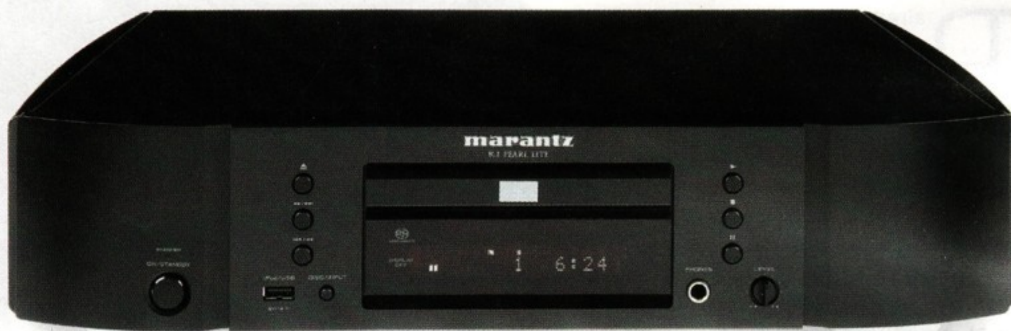
ABOVE: High feature count includes front panel USB input and built-in headphone amp with volume control

POLISHED PEARLS Whatever the music the SA-KI Pearl Lite always sounded polished, with a gracious demeanour. While demonstrating the communicative midband clarity that's a hallmark of 'classic' Marantz KI Signature