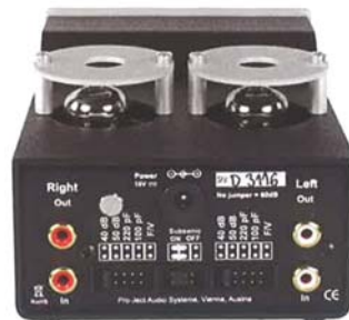
The back contains jumper plugs and sockets which vary the gain and capacitance, and can activate the subsonic filter.

PRO-JECT TUBE BOX DS PHONOSTAGE. £425.00