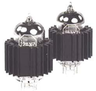
The ECC83 valves wear valve coolers that also eliminate the glass tube's tendency to be microphonic.