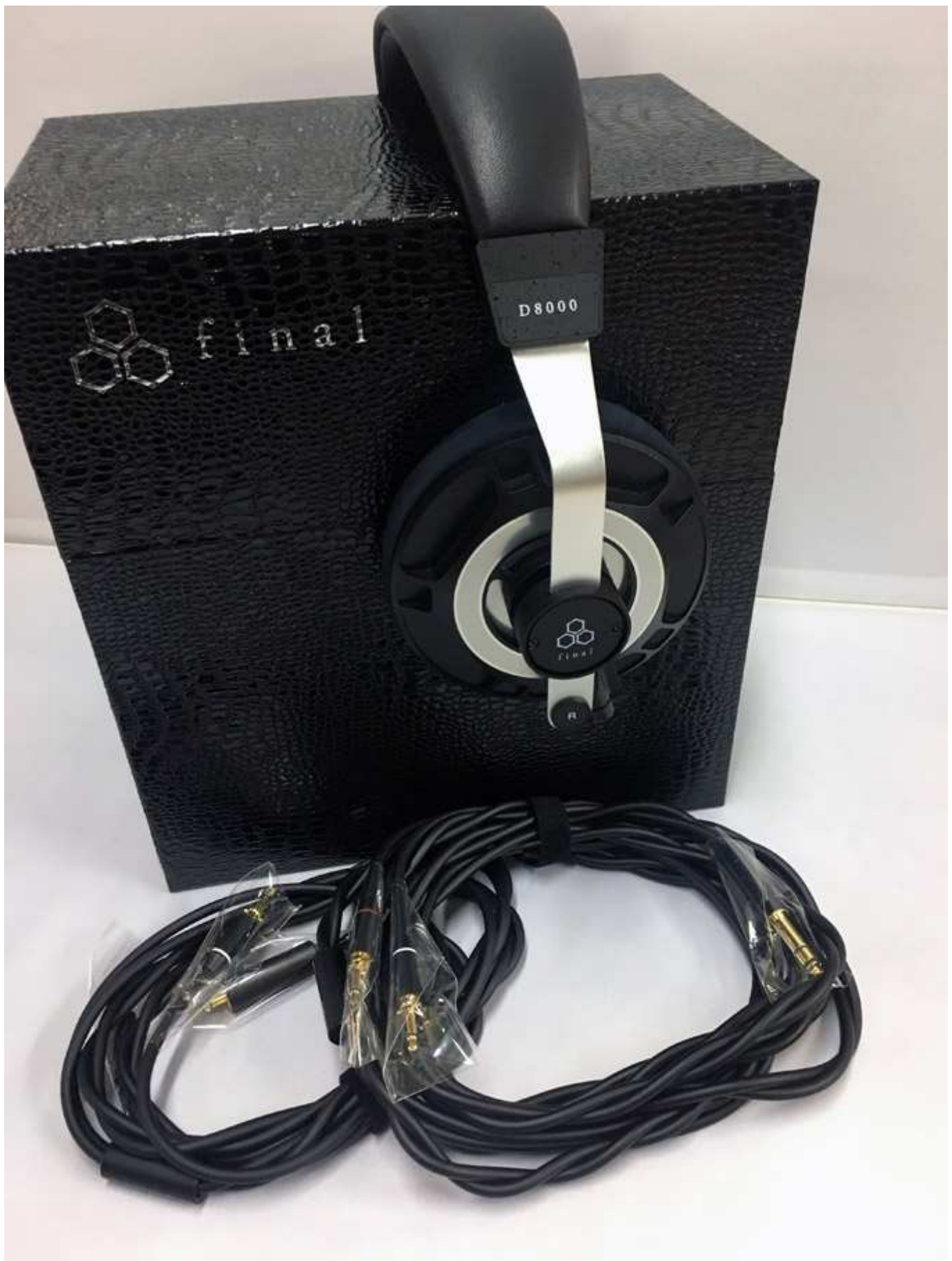
Final Audio D8000 – Contents in the box (headphone stand not pictured)