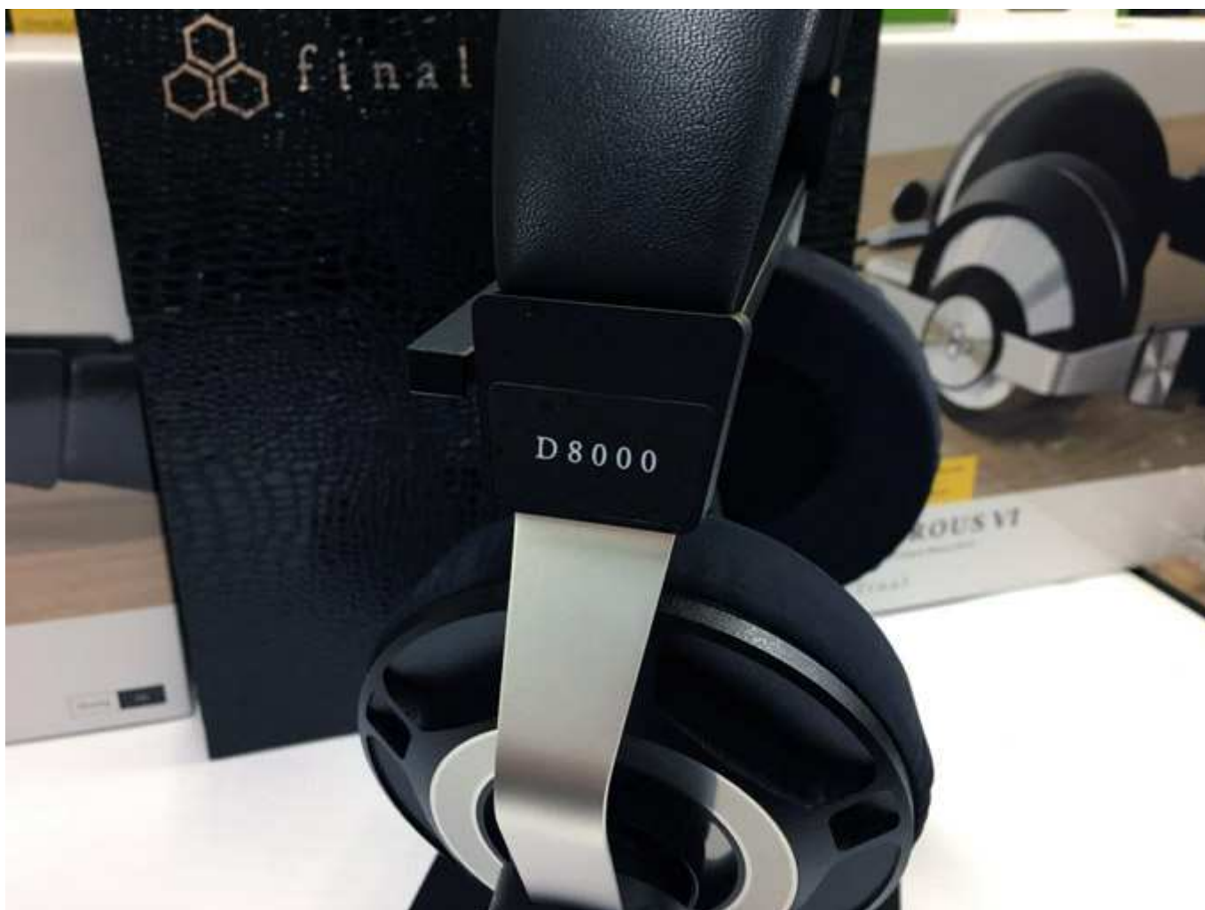
Final Audio D8000 Planar Magnetic Open Back Audiophile Headphones