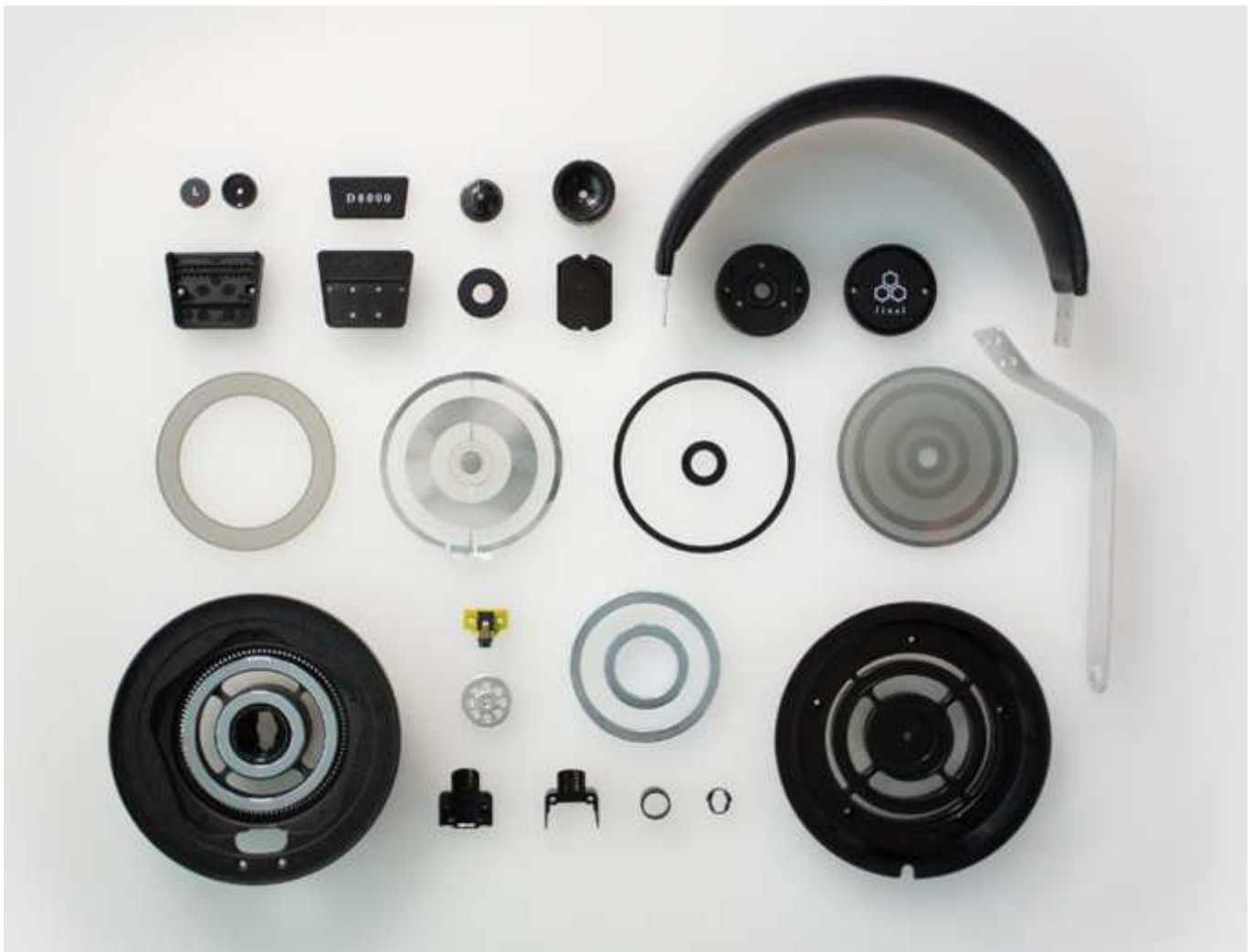
Final Audio D8000 is designed for easy repair and upgrade