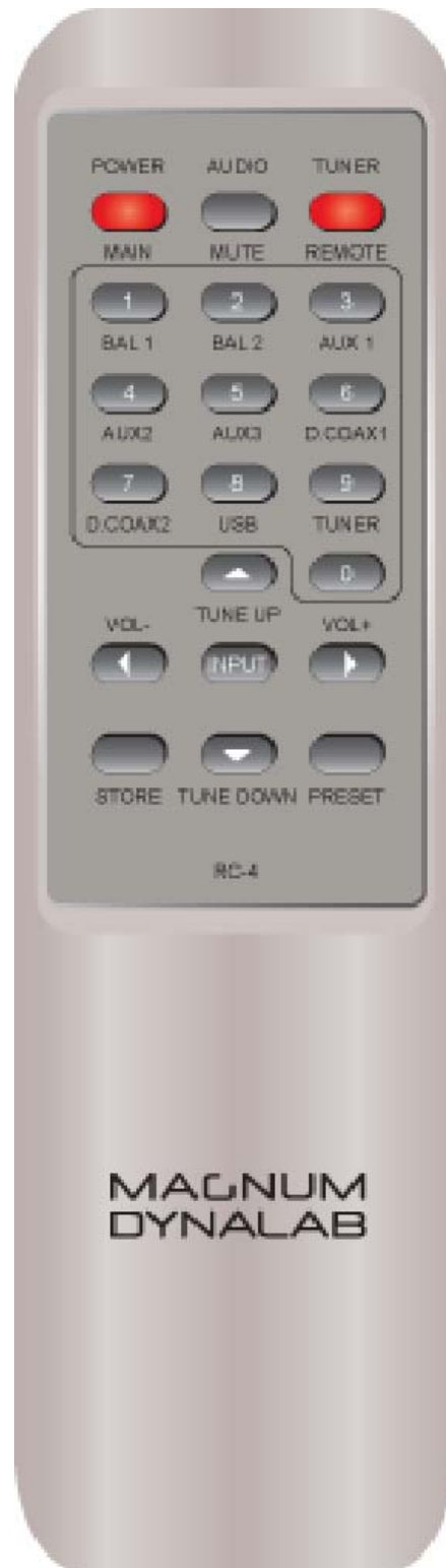
IMAGE OF REMOTE