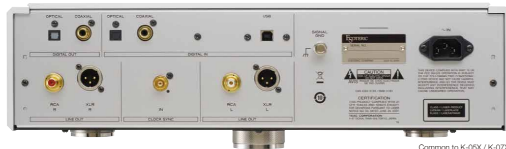
Common to K-05X / K-07X