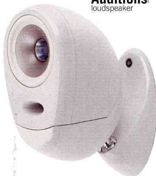
If desired, the optional foot bracket can be used to mount a satellite on the listening room wall

Thanks to the Dual Concentric driver arrangement, it is possible to move around a variety of listening positions without obvious shifts in tonal colour. In this respect alone, the Arena deserves careful consideration by anyone looking for a high-quality sub/sat system for use in a real