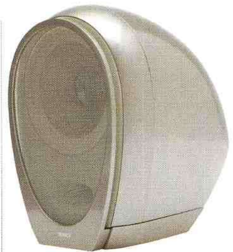
With grille fitted but without mounting bracket

Once set up in a surround-sound AV system, it was possible to sit back and enjoy the delicious small-scale sound that emanates from these ear-fooling point sources. Without the subwoofer connected there's no low bass