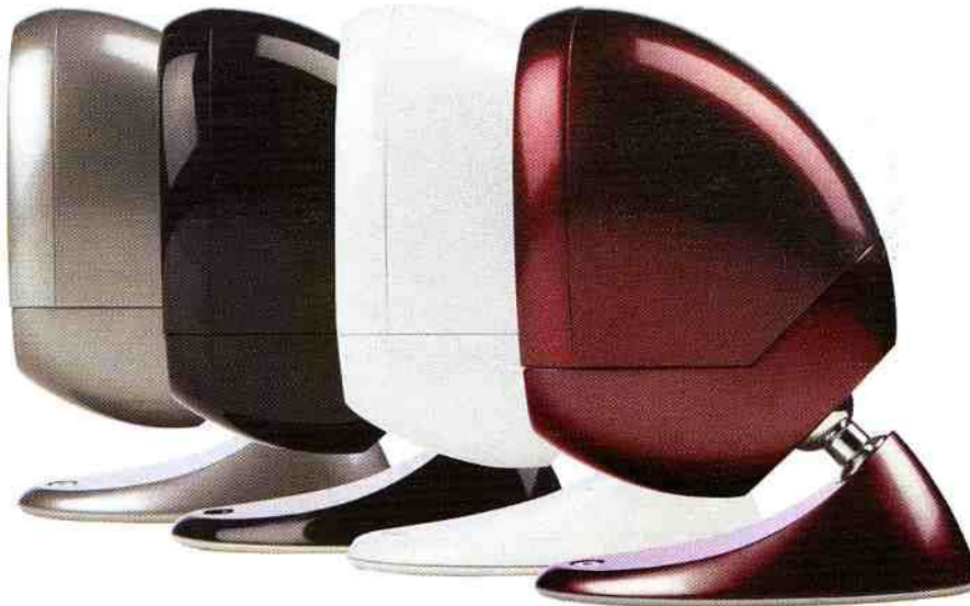
Colour options are silver, black, white and bronze

side by side, with the widerange tweeter sited in the left-hand driver.