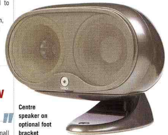
Centre speaker on optional foot bracket

“ Once you've picked them up, hefting the weighty metal castings lets you know of the solid engineering within