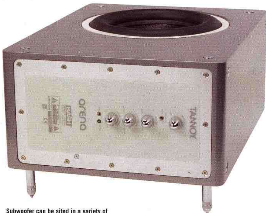
Subwoofer can be sited in a variety of orientations to suit taste or for best sound, including upward-firing...